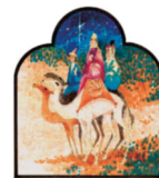
Unos sabios llegaron de oriente