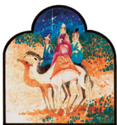
Magi from the east arrived